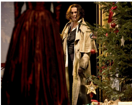
"Werther" at La Monnaie