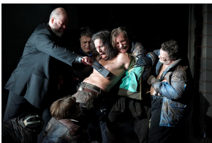
"Parsifal" at Staatsoper Stuttgart

Don Jose | Carmen Opéra Comique, Paris The Metropolitan Opera La Scala di Milano Arena di Verona